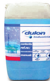
25 Liter container Mat.nr. 4-1105