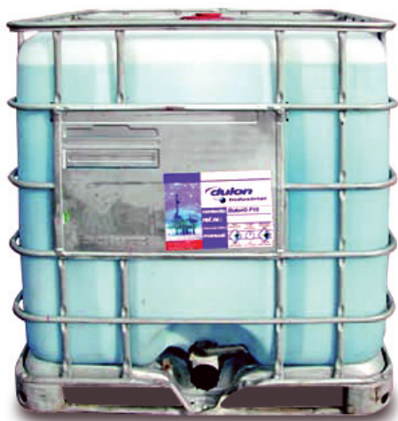
1000 Liter IBC Mat.nr. 4-1115