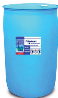
200 Liter drum Mat.nr. 4-1110